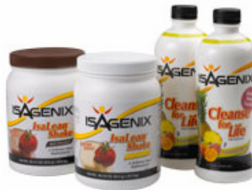
Shake and Cleanse Pak

The 14 Day EZ Cleanse Program is an alternative way to successfully use the Isagenix Cleansing & Fat Burning products for long term sustainable weight loss. This variation is especially recommended for previous Isagenix users who have struggled with cleanse days or those with certain health challenges or specific lifestyle situations which are not conducive to the stricter regimen of our 9 Day (aka 11 Day) plan. The 14 Day EZ Cleanse program may be repeated as often as desired.